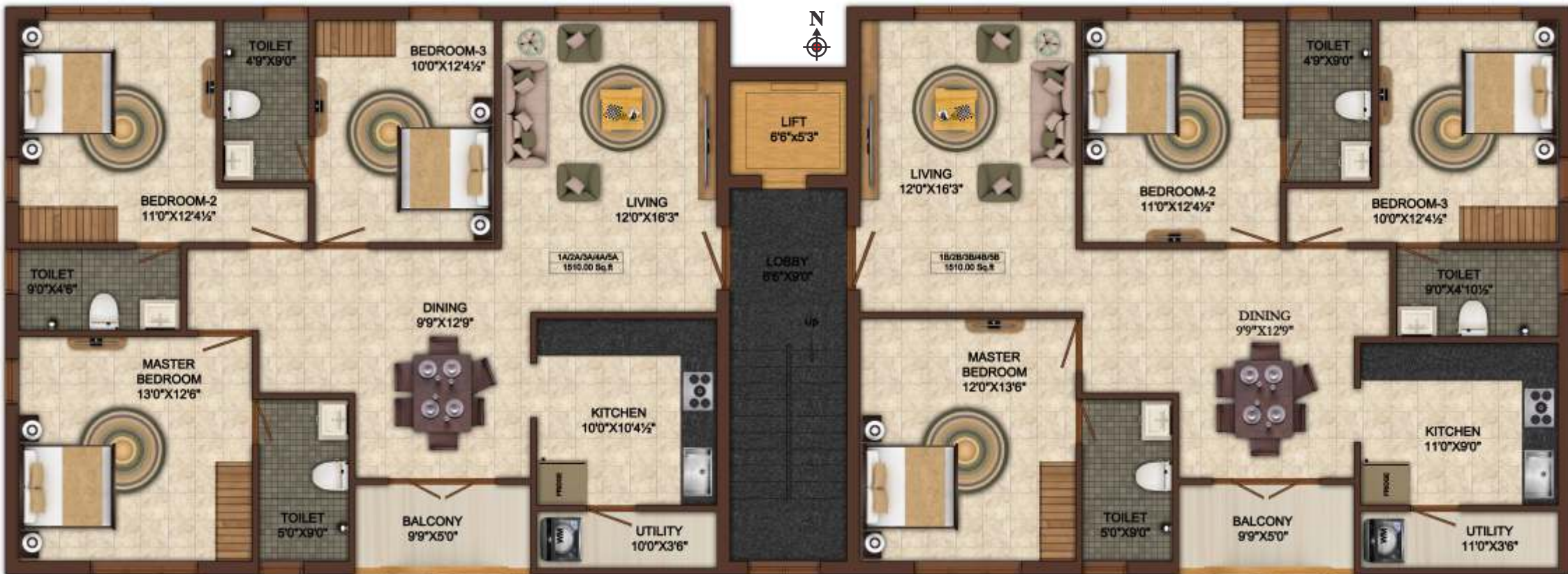
Typical Floor Plan - I, II, III, IV, V